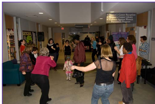
Dancing at the 35th Anniversary